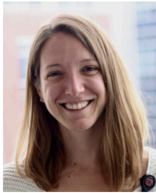
Serrano Lab| CReM| BU